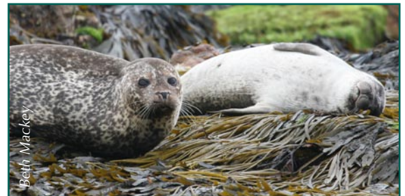
Harbour Seal mother and pup

The Moray Firth contains protected populations of harbour (or common) seals, bottlenose dolphins and salmon. Interactions between protected species present us with a conservation dilemma. In addition, these species support the economically important activities of marine wildlife tourism and fishing. Historically, this region has seen a great deal of conflict about how to manage seals in order to protect salmon fisheries.