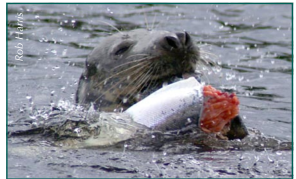
Grey seal with salmon

Licensed seal shooting is only carried out in cases when there is no alternative way of removing seals from rivers. This has led to many fewer seals being shot than in the past. The numbers being removed in this way are now considered to be within biologically safe limits, calculated in relation to the overall size of the Moray Firth seal population. Research is also demonstrating that some seals tend to specialise in feeding in salmon rivers.