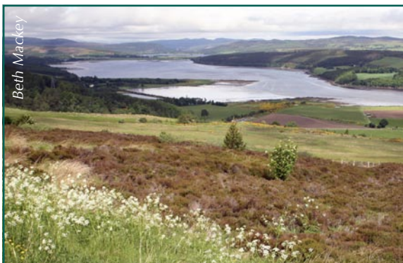
The Dornoch Firth and Morrich More SAC

The Plan was put in place in April 2005.