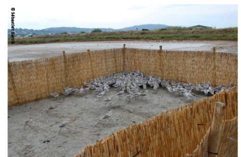
Slender-billed gull chicks grouped in corral