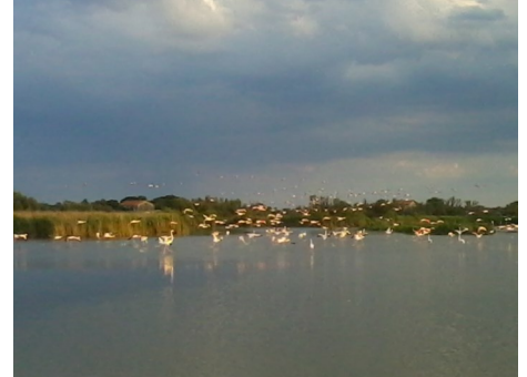
Flamingos departing from Pont de Gau Ornithological Parc (Saintes Maries de la Mer, France)

Thanks to this experience, I have gained a better understanding of an area I usually study on paper. I also learnt that it was essential to be fit, preferably well covered when working in ponds and to have a very acute sense of direction, the most blatant example being work in a reed bed, where, in no time, you find yourself surrounded by reeds towering over you from their 2.5 to 3 m height. Last but not least, the proximity to the animals/birds was just amazing! Whether it was looking straight into a turtle's eye, seeing a baby flamingo safely tucked under its mum's wing or watching flamingos fly. They ran on the water, spread their wings, revealing black feathers at the border of their pink wings and up they went, majestically flying in the sky, such a beautiful and mesmerizing sight!