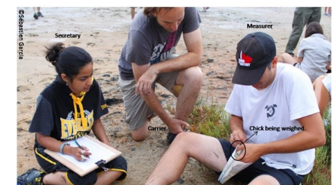
Weighing of a ringed slender-billed gull chick